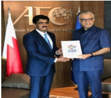
Medical Centre of Excellence Accreditation - Centre for Sports Science by Asian Football Confederation (AFC), Kuala Lumpur