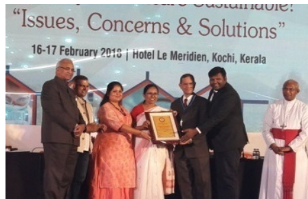
Healthcare Excellence Award 2018 by the Association of Healthcare Providers India Ltd.