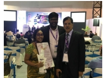
Medgate - Certificate of Excellence 2018 by MT India Healthcare Awards