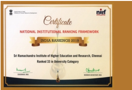
Ranked 33 in University Category