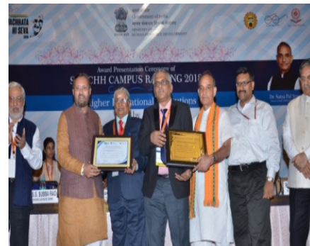
Swachh Campus Ranking 2018 5 th among Universities (Residential)