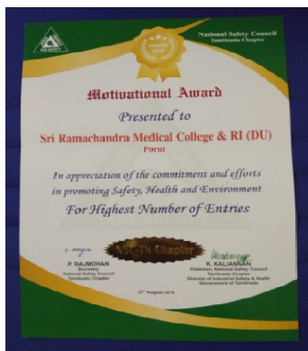
Motivational Award by National Safety Council (NSC), Tamil Nadu Chapter