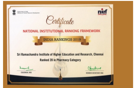
Ranked 20 in Pharmacy Category