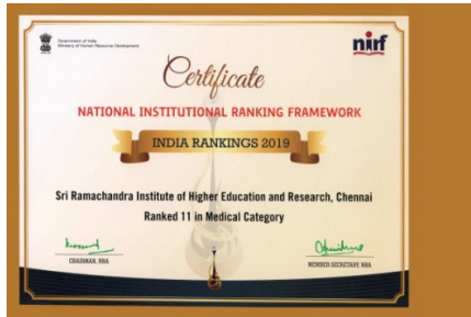
Ranked 11 in Medical College