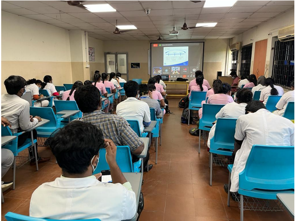
Alumni & students attending the webinar