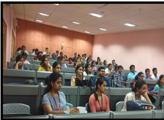
MBBS students at the Presentation in the demo hall