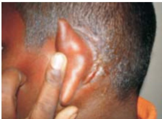
Fig.4. Post aurial wound after 6 months after surgery

In consultation with pulmonologist antitubercular therapy was started (ATT) (2HRZE/ 4HR) based on the histopathological report and clinical suspicion and was discharged. 2 weeks later the patient came back with a discharging sinus in the post aurial region and persistent global head ache. HRCT scan of the temporal bone and brain showed soft tissue opacity in the mastoid suggestive of mastoiditis. (Fig.2). A differential diagnosis of congenital cholesteatoma, tuberculosis otitis media (TOM), or fungal granuloma was considered. He was taken up for surgery. Through a postaural incision the fistula and granulations were excised. The mastoid cortex was found to be filled with pale granulations which were extending up to the tip cells below. The sinus plate was found to be eroded and granulations were found on the sinus and the dura. Granulations were carefully removed. The mastoid antrum was found to be free of disease, tympanum was normal with normal ossicular chain. Granulation tissue was sent for histopathological examination (HPE), acid fast bacilli (AFB) staining and culture. AFB staining and culture were negative, HPE showed chronic inflammatory granulation tissue with ill defined epithelioid granulomas having multinucleated giant cells and caseating necrosis suggestive of tuberculous granuloma [fig. 3]. He was continued on ATT and after follow up of 6 months he is asymptomatic with normal hearing (fig. 4).