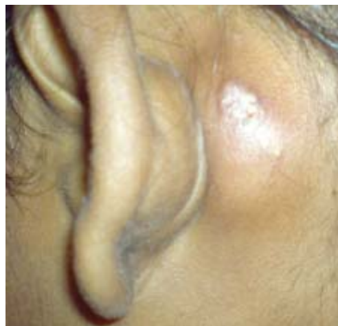
Fig. 1 Post Auricular Swelling on the left side

Examination showed a smooth 2x4 cm left postaural swelling, the skin over the swelling was normal (Fig.1), no